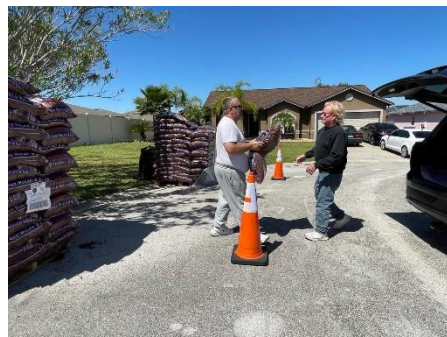
HOA Board President assisting with mulch

Our annual tradition of providing free mulch to our homeowners and renters is back. Come out on Sunday, April 16th, and claim your free bags. Beginning at 10:30am, you may line up with your vehicle on Monaco Drive (down by the cul-da-sec). The giveaway will begin at 11:00am and will run until 2:00pm or until supplies run out. When you get to the front of the line, check in with a Board Member to claim your mulch. Each home may receive up to five bags of mulch. At 1:00pm, if any mulch remains, homeowners and renters may return for a second round of five bags per home. The mulch is given away on a first-come, first-serve basis and when supplies run out, the giveaway is complete.