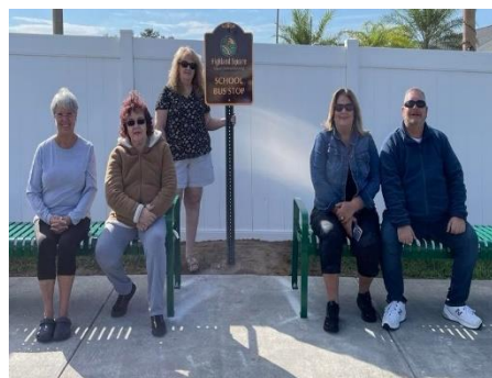
2023 Board of Directors at new Bus Stop

and some new signage, our children are now able to be off the roadway, seated comfortably, and able to safely wait for their school bus to arrive. The Board of Directors was on hand for the Grand Opening celebration on December 1 st , where we gave out free donuts and answered questions. We even had our Haines City PD friends out there to help us welcome our students to their new bus stop. If you are a parent, please remind your children that this is the only acceptable location to meet their bus and to remove any garbage that they may have. We would like to keep this space clean and tidy for years to come. Also, if you choose to wait with your children for the bus arrival, please avoid parking anywhere along the bus stop area. This is for the safety of our kids and to protect the sensitive irrigation system that is located there. Also, please avoid parking in the right-turn lane to our community. This is also unsafe for drivers who are leaving the community.